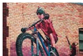
Cuyuna Area Murals Continue

Graphic Packaging will be investing $7 million in building improvements. This upgrade is in response to Europe's push for more sustainable packaging options. Improvements will include machinery upgrades and basic updates throughout their 35,000 square foot facility. The updated space will be used for fabricating parts, assembling machines, and quality-control testing.