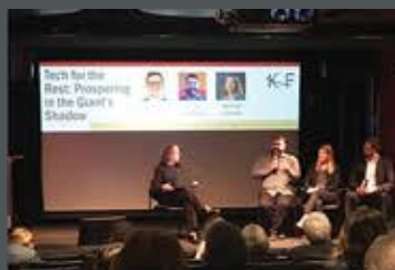
ICF New York Broadband Efforts Continue