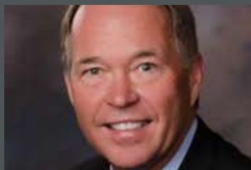
EXEC Led Outreach to Business Sector