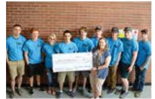
Sun Junkie Apparel