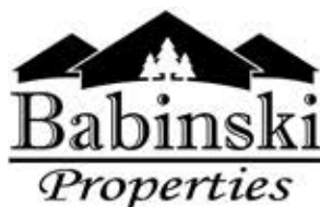
Babinski Housing Project Planned for Breezy Point