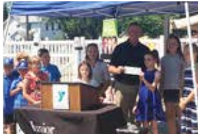
YMCA - Sports for Life