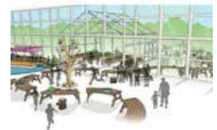
Children's Museum Site Exploration